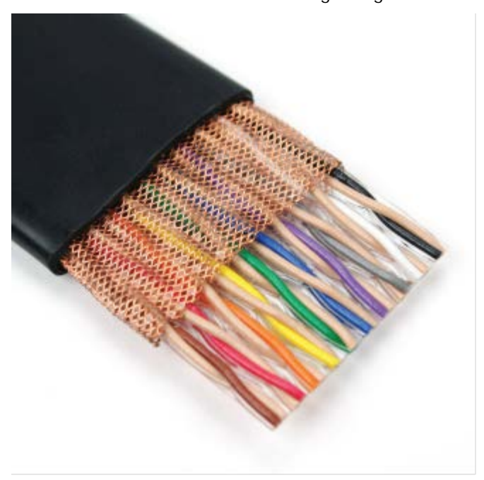
Fig. 3 Use of shielded flat cables with pairwise twisted wires

The driver cables may also be shielded against magnetic fields by using an additional metal shield around the cable. Pre-assembled cables according to Fig. 3 with shielding (e.g. 1785 series from 3M^{TM} ) may be purchased.